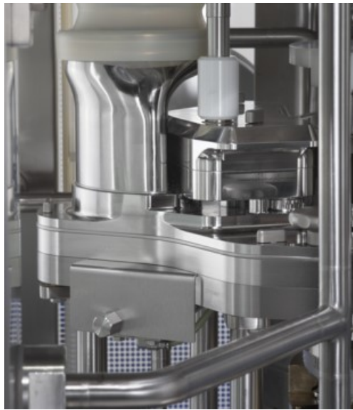
Figure 4.C-59 High-containment design tablet press: detail of filling unit (left), and fluids discharge (right)

This text is an excerpt from Chapter 4.3 Hygienic Design of the GMP Compliance Adviser .