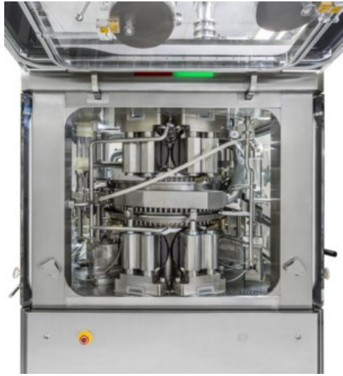
Figure 4.C-58 High-containment design tablet press: de-duster (left), and press compartment (right)

For hygienic design, shaft feedthroughs should be designed so that the seals to the base plate are not on the base plate level, but on a raised section incorporated into the plate. As shown in the detail drawing in Figure 4.C-59, with the liquid drain, the base plate is manufactured in one piece and the feedthroughs are milled into the base plate as raised sections. This significantly reduces deposits in the seals. The base plate is also milled at an angle to a lowest point so that the cleaning medium can drain off. All seals are flush with the surrounding surfaces and therefore do not allow product deposits to form. Another feature of good hygienic design is the avoidance of recesses in screw heads and other elements where product residues can accumulate. This can be achieved by consistently avoiding recesses and, as in the example, using custom screw designs.